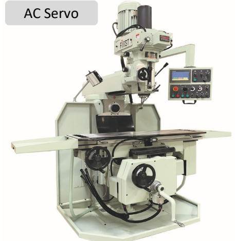
Model LC-205VHD illustrated