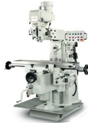
Model LC-20VSG illustrated